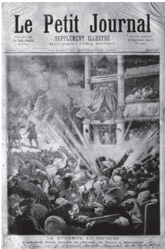
Figure 1. Explosion of Gran Teatre del Liceu de Barcelona in the cover of the newspaper Le Petit Journal , 1893.

Historically, workers' associations assimilated the republican militancy and the first socialist ideas without too