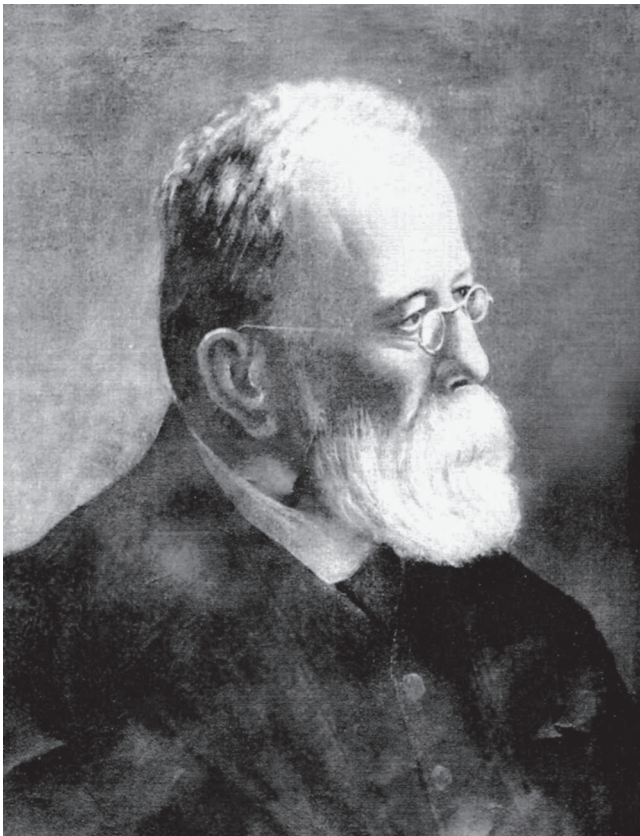
Figure 3. Anselmo Lorenzo (1841-1914). Sometimes called “the grandfather of Spanish anarchism”, he was one of the original Spanish anarchists and highly active within the movement from his meeting with Giuseppe Fanelli in 1868 until his death in 1914.

In the 1890s, there was yet another convergence between the neophyte ideologues of anarchism and young