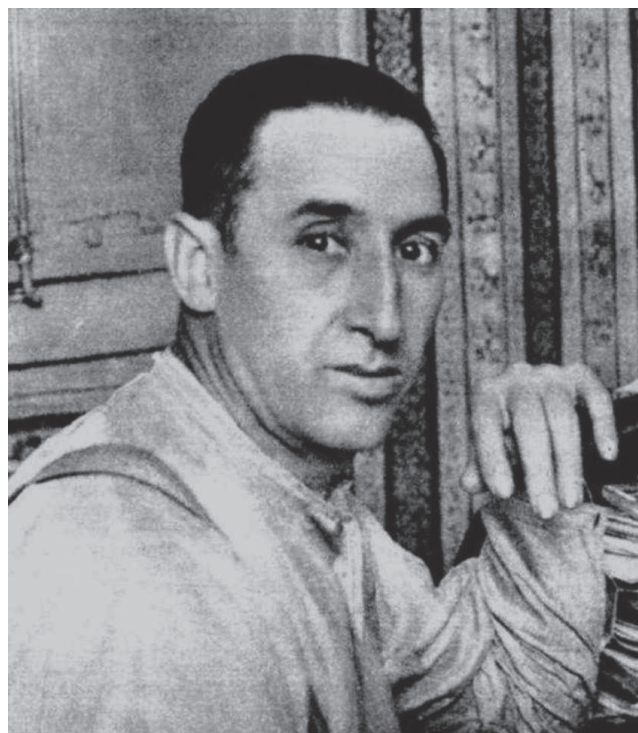
Figure 8. Angel Pestaña (1886-1937) was a Spanish anarcho-syndicalist and later syndicalist leader in Barcelona.

Violence was nothing new in Spain. It had always been a factor in political struggles coexisting alongside peaceful, civic demonstrations. In the early decades of the 20th century, this trend was accentuated and extremist groups of all stripes systematically used aggression to impose their will. Since the founding of the sole unions, the CNT had begun to pressure workers to join their respective unions. Under these circumstances, the conflicts among the CNT members of the sole union and workers from other unions or against membership were ongoing: the CNT wanted to force union membership and the payment of fees, and the result was threats, coercion and aggression among workers.