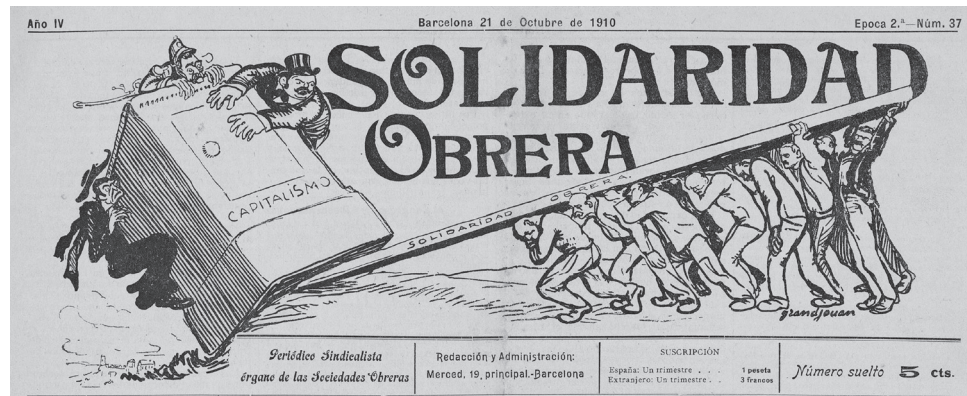
Figure 4. Front page of Solidaridad Obrera , the newspaper published by the Catalanian/Balearic regional section of the anarchist trade union Confederación Nacional del Trabajo (CNT).

than 400 people were held in the castle-fortress on Montjuïc and tortured as they awaited trial. Afterward a mock trial was held, known as the Montjuïc Trial, and thus began a sweeping legal campaign against anarchism, which had been repeatedly called for by the conservative sectors ever since the attacks had started. The ruling handed down at the trial was harsh: five death penalties, five prison sentences and dozens of people absolved but forced to go into exile. The police spoke about an anarchist conspiracy, and they always regarded the anarchists as a menace to the forces of law and order. Despite all this, the authorship of the attack was never clearly established. 18