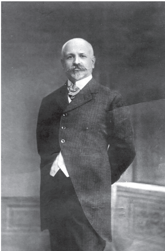
Figure 6. Francesc Ferrer i Guàrdia (1859-1909) was a Catalan free-thinker and anarchist. He opened the Escola Moderna (The Modern School) to teach middle-class children radical social values. Following the declaration of martial law in 1909 during the Tragic Week, he was arrested and executed without trial by firing squad at Montjuïc Fortress in Barcelona.

Novels were another means of cultural dissemination. Generally speaking, the works depicted an idyllic rural life far from industrial society and spoke with a certain degree of candour about an idealised world and chimerical characters, both redeemed and redeemers. There were signal publishing houses that targeted the working class readership, such as Maucci, Sempere and La Revista Blanca (which also published the magazine of the same name). The La Revista Blanca publishing group was the most influential. By imitating the French models, it combined the publication of magazines and literary and militant newspapers ( La Revista Blanca , Tierra y Libertad , El Luchador ) with collections of stories such as “La Novela Ideal” (which issued around 600 titles), “La Novela Libre” and “El Mundo al Día”. It was a combination of ideology and commercial acumen which very successfully spread a sentimental, teary-eyed sort of novel among the anarchist working class and strove to include elements of social and female emancipation with the purpose of divulging anarchist ideological principles in an educational way. Their